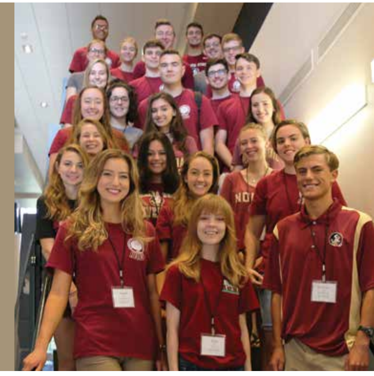
The Presidential Scholars class of 2021

The program also offers support to help students shape their entire college experience. In addition to covering most tuition expenses, the scholarship provides $12,000 for educational enrichment opportunities such as international experiences and service learning projects.